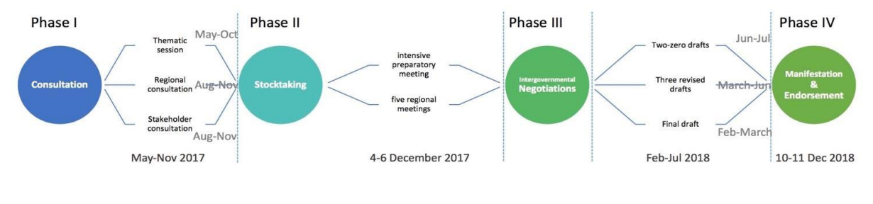
Figure 2. Phases of GCM

The manifestation and endorsement phase. The UN General Assembly endorsed the Global Compact for Safe, Orderly, and Regular Migration in a vote among the 152 member states. The Czech Republic, Hungary, Israel, Poland, and the United States voted against it (Risse, 2018). Algeria, Australia, Austria, Bulgaria, Chile, Italy, Latvia, Libya, Liechtenstein, Romania, Singapore, and Switzerland abstained from voting, and 24 member-states did cast a ballot on the compact's adoption (Risse, 2018). The endorsement occurred in the presence of the heads of state and government and high representatives at the Intergovernmental Conference to Adopt the Global Compact for Safe, Orderly, and Regular Migration in Morocco held on December 10–11, 2018.