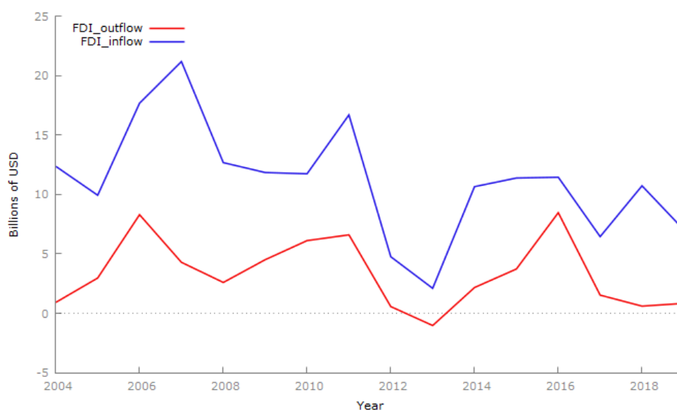
Figure 1. FDI flows in Poland in 2004-2019 (in constant prices of 2004)