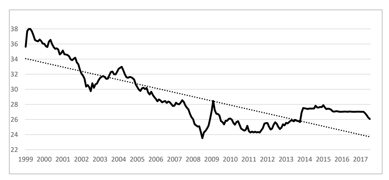
Figure 1. CZK/EUR exchange rate development, monthly exchange rates from January 1999 to Iuly 2017

Can the Czech koruna be expected to be subject to depreciation pressures? The outlook for the CZK/EUR is shown in Figure 1. Long-term development trend of the CZK/EUR is heading toward appreciation.